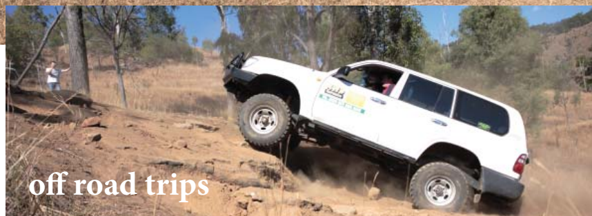
off road trips